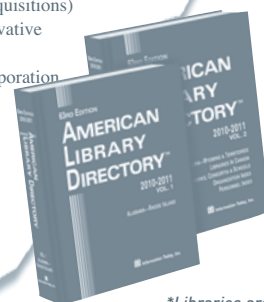
*Libraries are identified by using nine different classification codes.